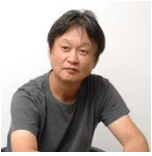
› Naoto Fukasawa