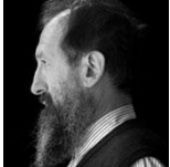
› Michele De Lucchi